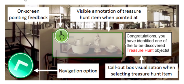
Figure 2. Three applications of the AVV methodology in the demonstrator.

methodology [2]. This methodology (and its Web-compliant implementation) is intended to transform video consumption from a passive into a more lean-forward type of experience by providing the ability to superimpose (potentially interactive) overlays on top of the media content. The navigation options are represented as arrows indicating the direction of potential follow-up paths; their visualization is toggled when the playback of the current path is about to end. The treasure hunt objects on the other hand are (invisibly) annotated by means of a transparent overlay. When the user points to such an object, the visual style of the associated AVV annotation is on-the-fly transformed (through CSS operations) into a semi-transparent one. If the item is subsequently selected, an informative AVV-managed call-out widget is visualized. Finally, the AVV methodology is also exploited to present visual feedback of the user's current pointing location. This is realized by dynamically instantiating an overlay (carrying a green hand icon) as soon as the user enters pointing mode and by continuously updating its coordinates as the pointing operation is being performed. When pointing offscreen (only possible with the gestural interface), the hand icon is clamped to the nearest on-screen position and turns red. Figure 2 illustrates the three applications of the AVV approach in the demonstrator.