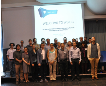
Figure 10: Group photo at WSICC'13.