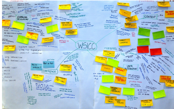
Figure 1: Mindmap result of WSICC'13.