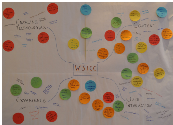
Figure 3: Mindmap result of WSICC'15. Available in better resolution on the website. All mindmaps are currently being digitized by the organization team to be further analyzed for scientific publication of the workshop results.