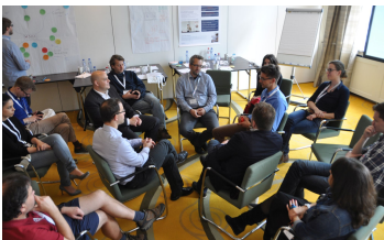
Figure 6: Fishbowl discussion at WSICC'15.

User Interaction: This dimension analyzes novel interaction approaches, concepts, and paradigms. Thereby, interactivity might be interpreted both as computer mediated communication as well as human computer interaction. Interest lies in: