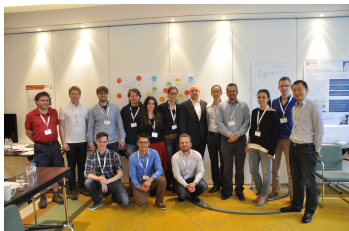
Figure 12: Group photo at WSICC'15.