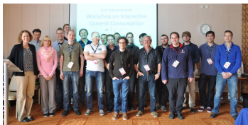
Figure 11: Group photo at WSICC'14.