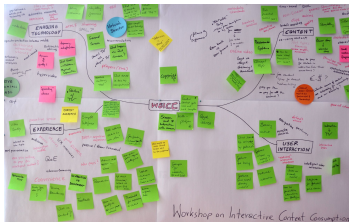
Figure 2: Mindmap result of WSICC'14.