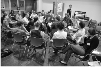
Figure 4: Fishbowl discussion at WSICC'13.