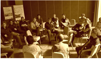
Figure 5: Fishbowl discussion at WSICC'14.