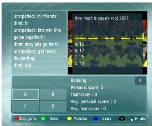
Figure 1: Question shown in overlay with the television screen. The viewer's input is restricted to answering the question.

Figure 1 shows the interface for the viewer when a question is retrieved from the interaction scenario and presented during the television show. The question is shown in overlay with the normal television image to create an immersive user experience. When a question is presented, the input the user can give is constrained according to the type of answer that is expected and the focus of the user interface is automatically shifted to the part of the user interface presenting the input possibilities. For example, figure 1 shows at the bottom